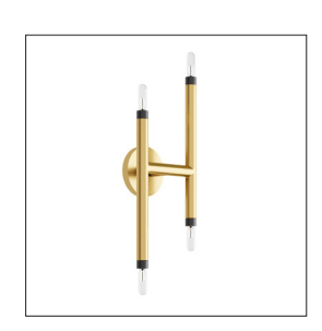
DFI03 H: 19 IN, W: 7 IN, D: 4 IN Antique Brass Contract Suitable As Is

The staggered bars of our sleek Ballard add an industrial charm offset with a two-tone finish. Crafted of antique brass-plated iron with bronze accents, its intriguing form recalls the linear spacing between bricks. This clever tubular design can also be mounted as a sconce. Damp-rated, although limited covered outdoor conditions may affect finish.