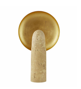
PTC42 H: 19.5 IN, Dia: 12.00 IN Sand, Faux Travertine

The luminous shimmer of antique brass creates a halo effect behind a rounded base of sand faux travertine. Its rounded intersection is soothing yet captivating, while the natural voids, veining, and color variants in the stone make this lamp a statement piece. Finish will vary.